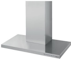
Hood KS Lux 2504 094