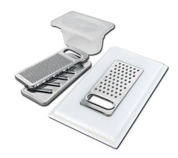
Graters kit with ring-holder and food collection tray 8159 101