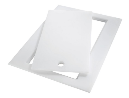
HPDE Twin chopping board 8644