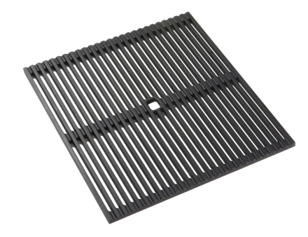
Black grid 8100 600