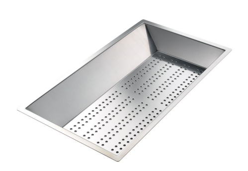
Stainless steel perforated tray 8151 000