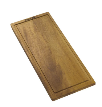
Walnut-wood chopping board 8642 000