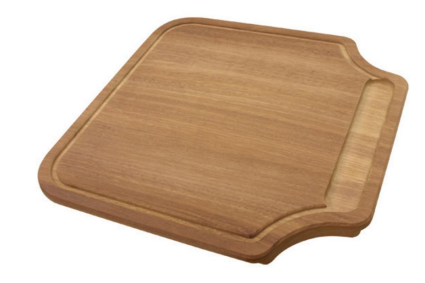
Iroko-wood chopping board 8646 000