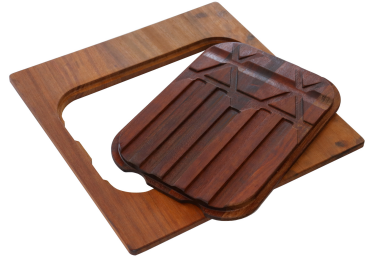
Iroko-wood twin chopping board 8644 004