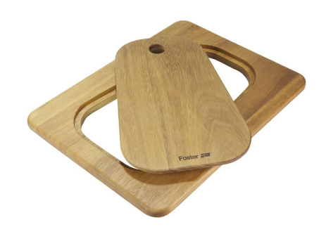
Iroko-wood sliding chopping board 8644 041