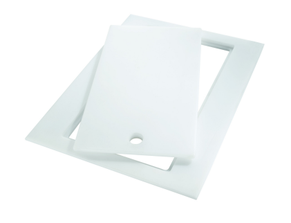
HPDE Twin chopping board 8644 101