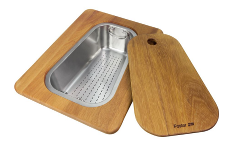
Iroko-wood chopping board with stainless steel colander 8644 042