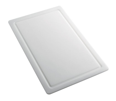
HPDE Chopping board 8657 001