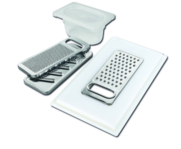
Graters kit with ring-holder and food collection tray 8159 101