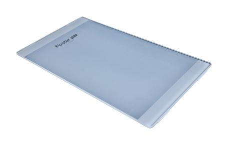
Glass chopping board 8631 300