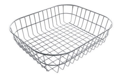
Stainless steel basket