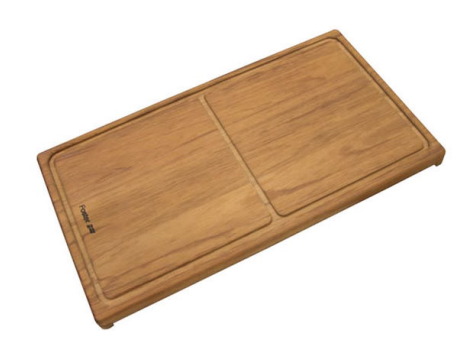
Iroko-wood sliding chopping board