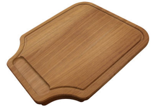
Iroko-wood chopping board