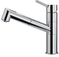
Mixer Tap F2000 - Basso