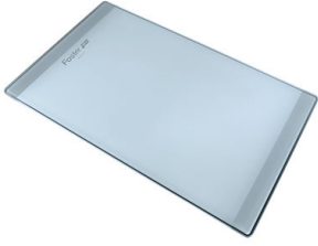
Glass chopping board