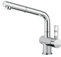
Mixer Tap Luisa