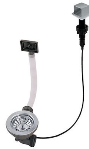
LIRA automatic waste fitting