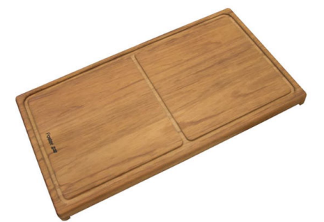
Iroko-wood sliding chopping board 8643 000