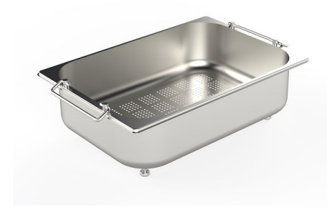
Stainless steel colander 8154 000