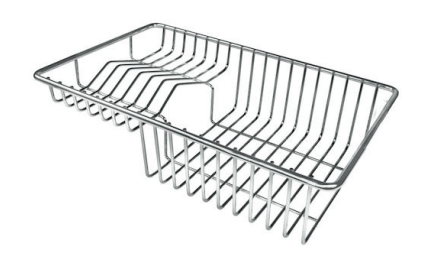
8100 303 * only in combination with the accessory 8644 101