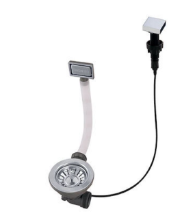
Automatic waste fitting 8407 113