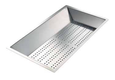
Stainless steel perforated tray

* only in combination with the accessory 8644 101