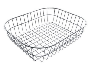
Stainless steel basket 8611 000