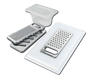
Graters kit with ring-holder and food collection tray