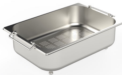
Stainless steel colander 8154 000