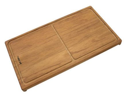
Iroko-wood sliding chopping board 8643 000