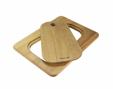
Iroko-wood sliding chopping board 8644 041