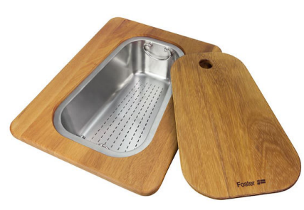
Iroko-wood chopping board with stainless steel colander 8644 042