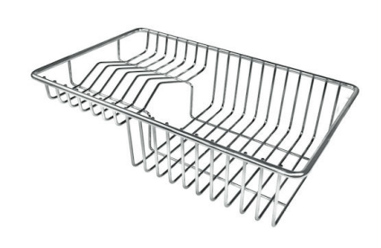
Stainless steel plate rack