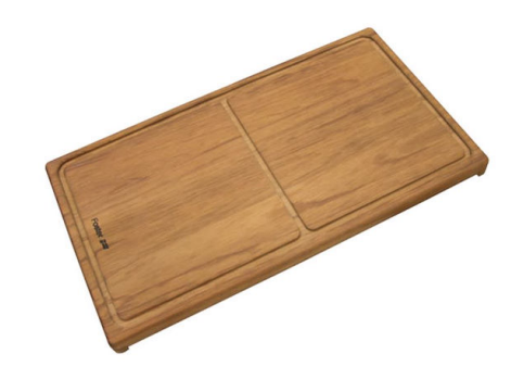
Iroko-wood sliding chopping board