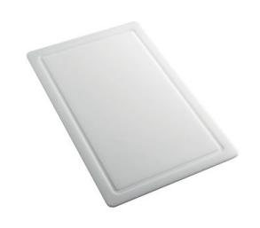
HPDE Chopping board