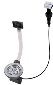
LIRA automatic waste fitting