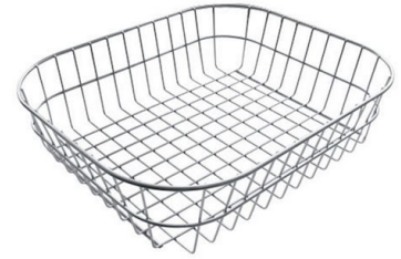
Stainless steel basket