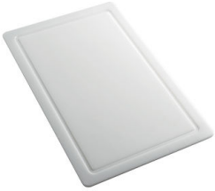
HPDE Chopping board