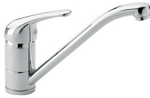
Mixer Tap S1000 - RO