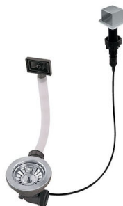
LIRA automatic waste fitting