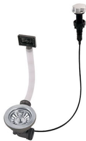
Automatic waste fitting