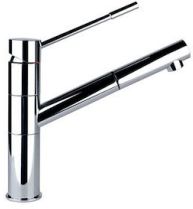
Mixer Tap Lorenzo