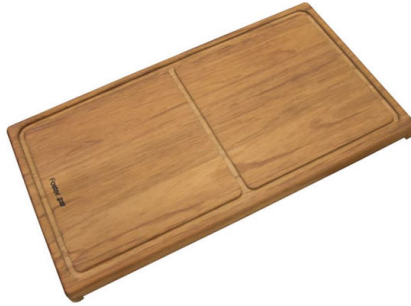
Iroko-wood sliding chopping board