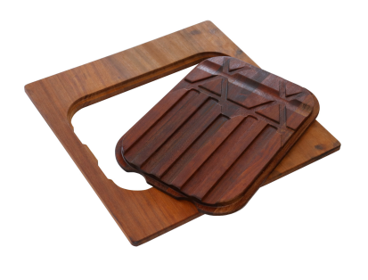
Iroko-wood twin chopping board 8644 004