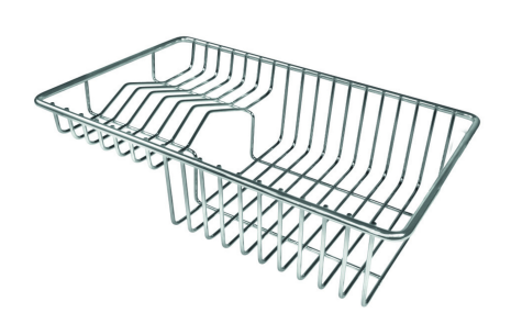
Stainless steel plate rack 8100 303