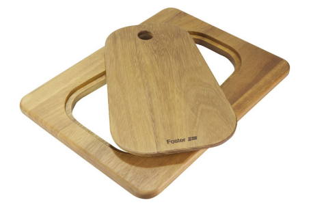
Iroko-wood sliding chopping board 8644 041