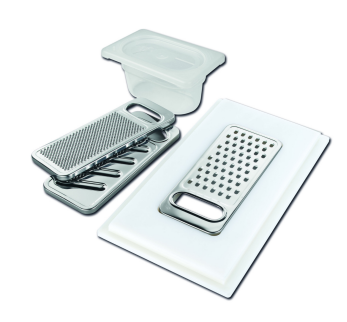
Graters kit with ring-holder and food collection tray 8159 101