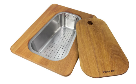
Iroko-wood chopping board with stainless steel colander 8644 042